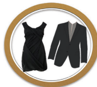
Coat & Optional Tie

Sunday Brunch; Santa Brunch & Dinner; Easter Brunch; Mother's Day Wine Society Tastings & Dinners